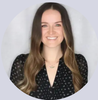
Chief Creative Officer & Community Outreach

Partners can expect authentic storytelling, targeted exposure to a military-focused audience, and collaboration rooted in shared values. VeteranPCS prioritizes meaningful partnerships that educate, empower, and create measurable impact for military families.